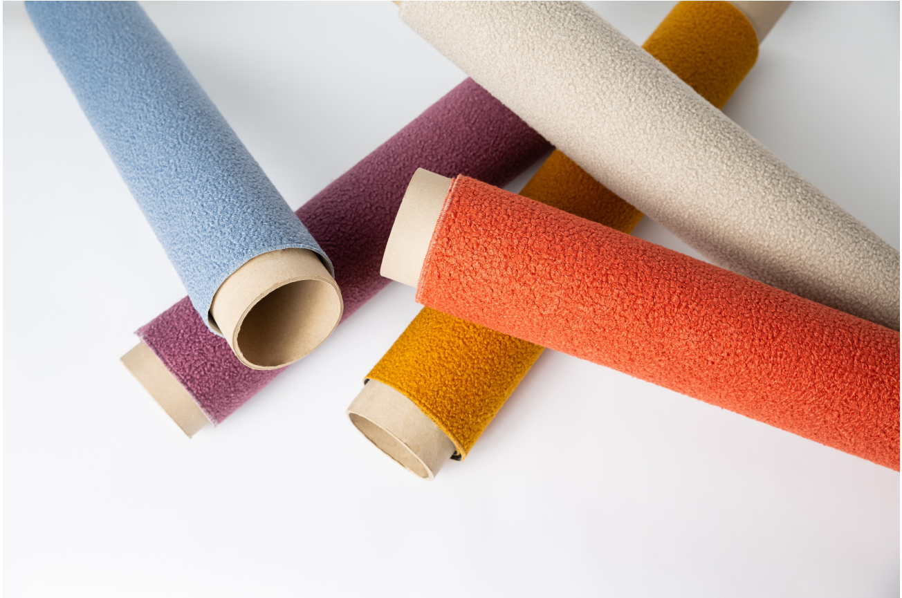
Framework Collection, in collaboration with Gensler, product design consultant - Huddle

260 Holbrook Drive Wheeling, IL 60090 USA T: 847.657.8481 F: 847.657.8641