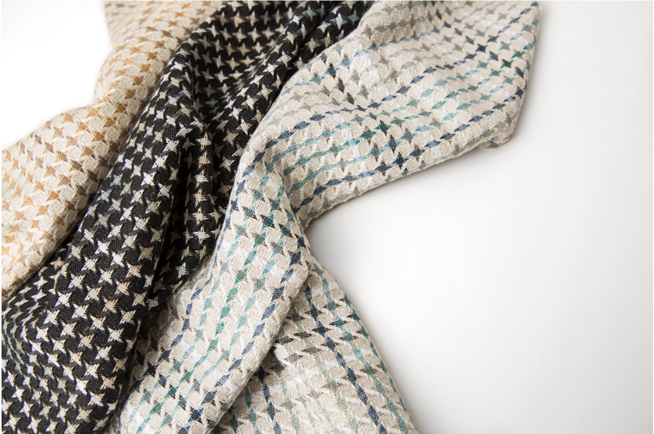
7300 Morning Star

260 Holbrook Drive Wheeling, IL 60090 USA T: 847.657.8481 F: 847.657.8641