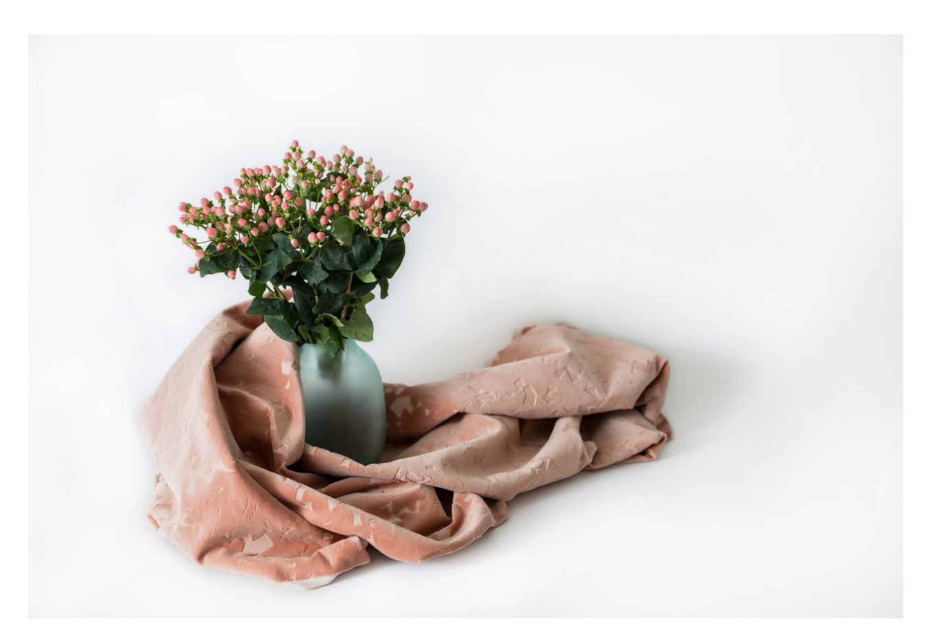
4234-03 Samara Blush

260 Holbrook Drive Wheeling, IL 60090 USA T: 847.657.8481 F: 847.657.8641