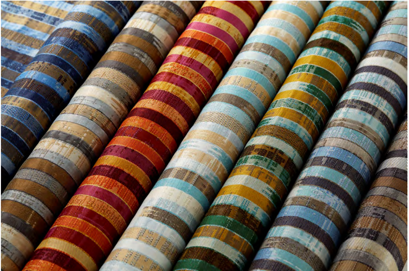
Left to Right: Aquarelle 4530: Avery 07, Wyeth 01, Demuth 05, O'Keeffe 02, Nilsson 06, Audubon 03, Hopper 08

260 Holbrook Drive Wheeling, IL 60090 USA T: 847.657.8481 F: 847.657.8641