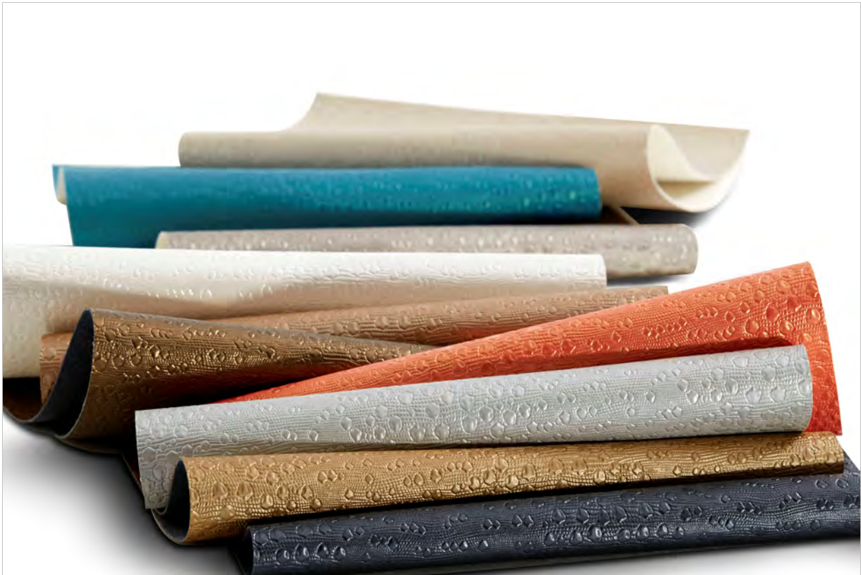
Top to Bottom: Komodo 3983: Batik 02, Monsoon 09, Crater 04, Jasmine 01, Sand 05, Sandalwood 08, Volcano 07, Megalith 03, Cashew 06, Obsidian 10

260 Holbrook Drive Wheeling, IL 60090 USA T: 847.657.8481 F: 847.657.8641