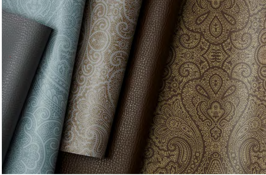
Filigree & Varsity

260 Holbrook Drive Wheeling, IL 60090 USA T: 847.657.8481 F: 847.657.8641