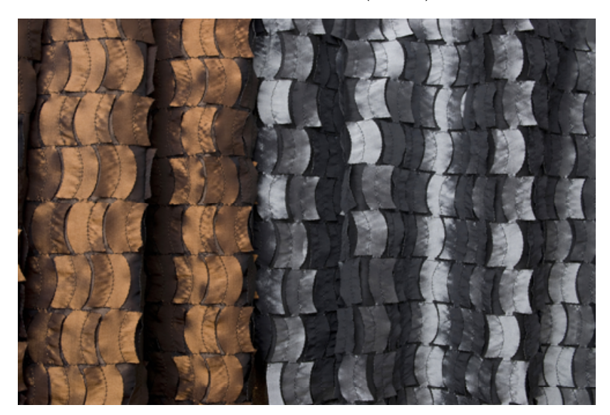
Rendezvous-California Dreamin' (9200-02), and Paris after Dark (03).

Two layers of luminous fabric come together in award-winning Rendezvous, a drapery constructed by laser-cutting a layer of stylish sails to create beautiful depth and luster. Available in three fashionable colorways, Rendezvous appears delicate but is durable enough to be used as pillows and throws.