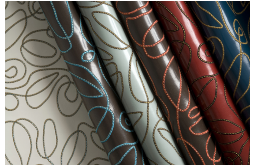
De-vine (3918) in Honeysuckle (01), Virginia Creeper (06), Sweet Pea (02), Passion Flower (05), and Morning Glory (04).

Award-winning De-vine is anything but average. Double-embroidered with a large-scale repeat, this faux leather is ideal for accent pieces in upscale interiors and can be paired with its durable solid counterpart Ooh La La to create a striking interior.