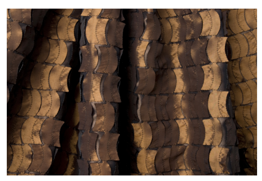
Rendezvous-California Dreamin' (9200-02).