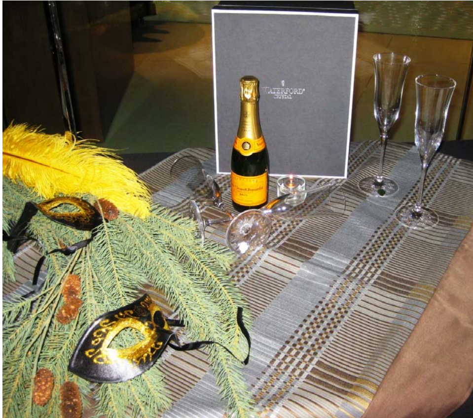
Brentano donated a geometric tablecloth made from their fabrics as well as a set of Waterford Crystal champagne flutes to create a festive holiday table.